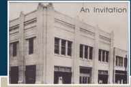
An Invitation Cohen and Wolf, P.C. cordially invites you to celebrate the opening of its new office in the former United Illuminating Building 1115 Broad Street, Bridgeport, Connecticut Thursday, November 17, 1983 4:30 to 7:30 PM